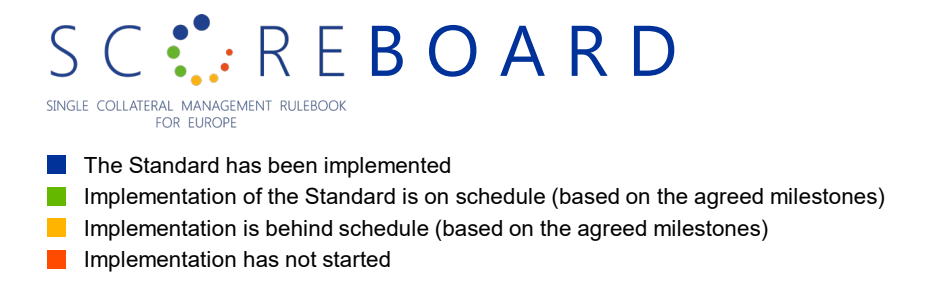
Table 1 Compliance level with the standards by each entity type