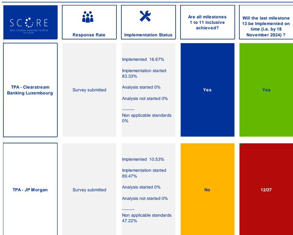
Figure 1 Summary of the monitoring exercise

The implementation of the Triparty Collateral Management Standards in the Luxembourgish market is on track for Clearstream Banking Luxembourg. Implementation is generally on track for JP Morgan.