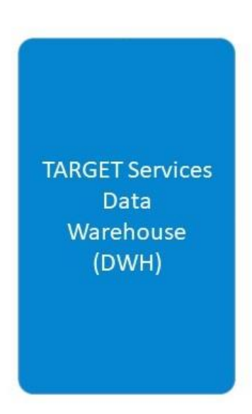
Figure 1 - High level DWH coverage

Each component of the T2 Service and T2S has its dedicated production database. The DWH consolidates the content of those production databases into a single database for operational and statistical purposes for the operator, CBs, ancillary systems and payment banks. It is ensured that the provision of data from production databases to the DWH does not influence the functioning and availability of the T2/T2S Services and the respective underlying production databases.